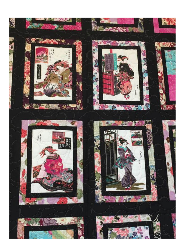
Quilt center close up