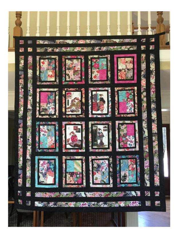
The Quilt Front