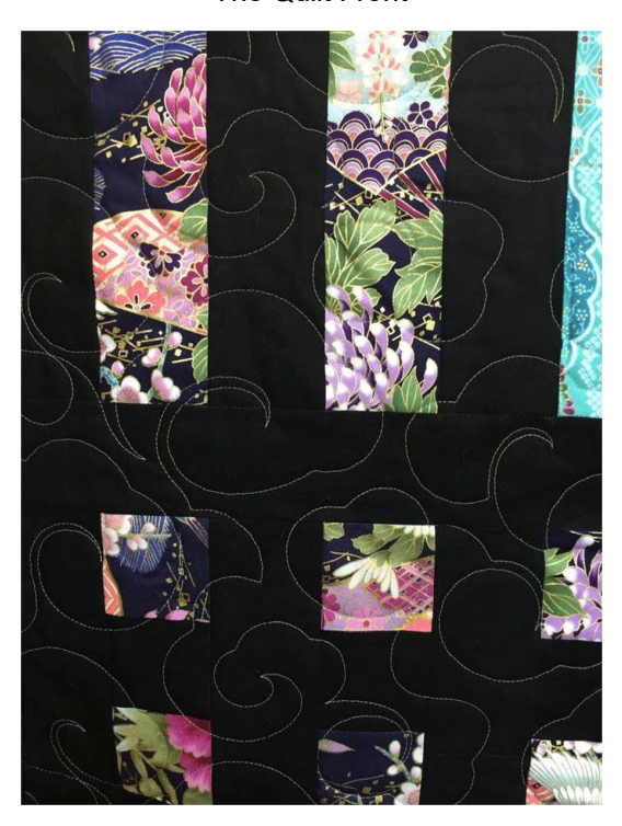
Asian Cloud Quilting Pattern