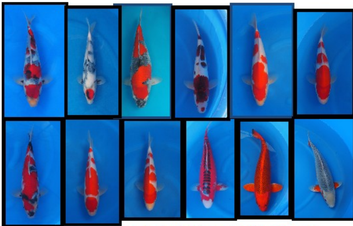
Small Sample of the Fish in the Mud Ponds!

"Sekiguchi", "Hosakin", "Marudo", "Ogowa", "Koda", "Marusaka", "Miyatora", "Maruju", "Marusei" & MORE!