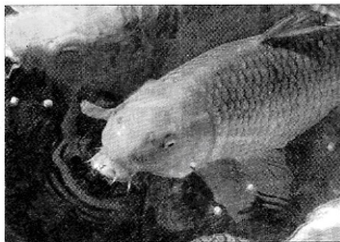
Distinctive koi are beautiful in a backyard pond.

Q: I have monkey grass growing next to my lawn and it is invading via underground runners. How deep should I bury a barrier to control this? — Art Geist, email