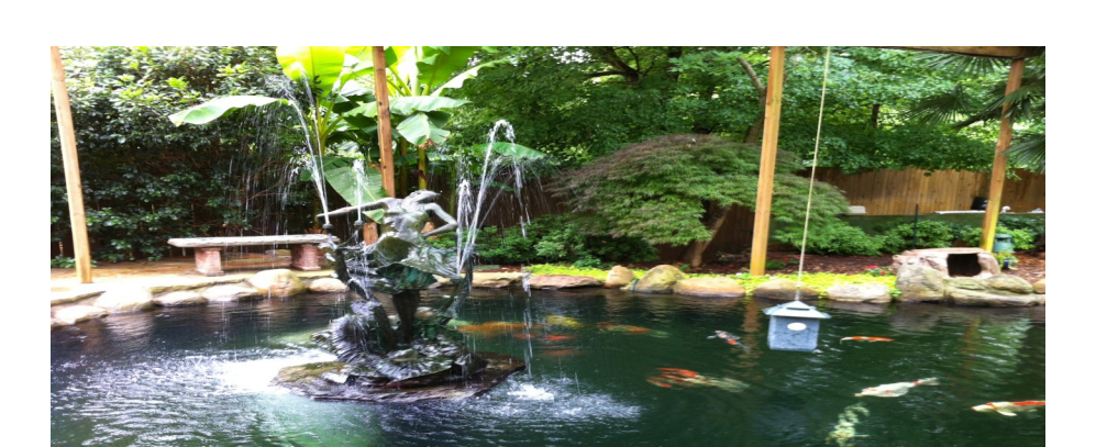
By the Pond

Atlanta Koi Chronicles is a monthly publication of the Atlanta Koi Club. Material is selected for its interest to Koi and Pond enthusiasts. AKC Koi Chronicles accepts no responsibility for the of the contents. accuracy Reproduction is permitted provided that this newsletter and/or the original source are credited. Articles may be submitted to the editor.