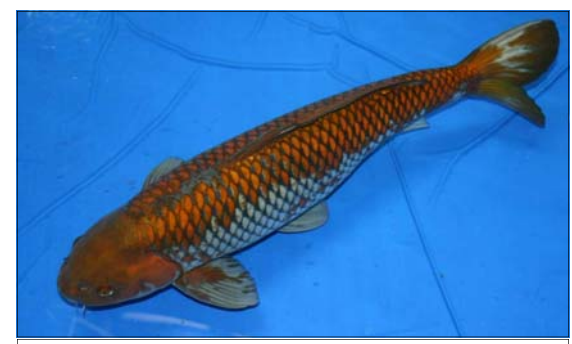
This huge Ochiba won our Friendship Award. Her tank mates were a doitsu Ochiba of equal size and a stunning butterfly Sanke. The owners were Novice exhibitors!