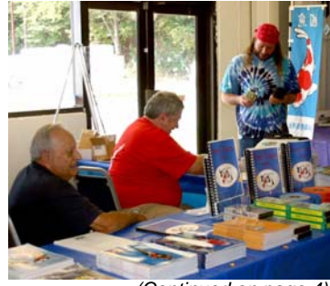
(Continued on page 4)