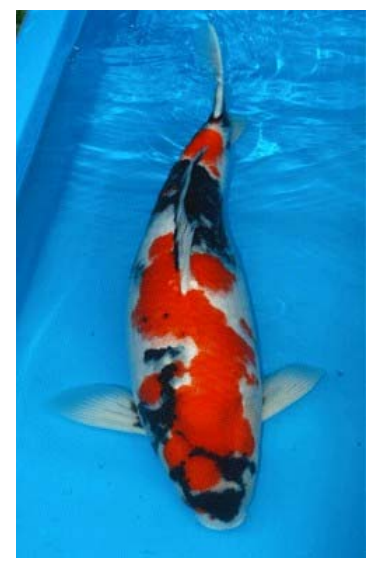
Grand Champion Showa

Atlanta Koi Chronicles is a monthly publication of the Atlanta Koi Club. Material is selected for its interest to Koi and Pond enthusiasts. AKC Koi Chronicles accepts no responsibility for the accuracy of the contents. Reproduction is permitted provided that this newsletter and/or the original source are credited. Articles may be submitted to the editor.