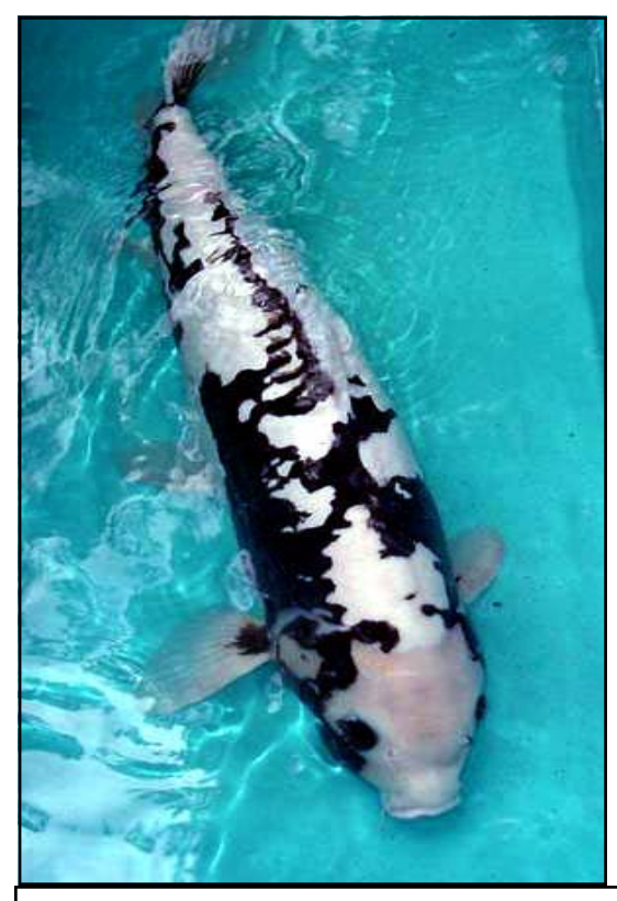
Reserve Grand Champion Kumonryu