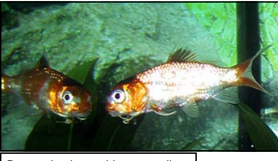
Bogey checks out his new smile.

glance before quickly dashing away. The long-term success of his surgery still remains to be assessed, but for the time being I'm grateful that Bogey escaped the culling process and that he can continue to delight all with his amusing antics. In appreciation to the team that helped Bogey, I'd like to say, on his behalf, "Here's looking at you, Vets."