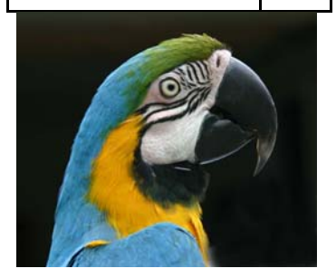
You never know who you'll see on the pond tour!

Atlanta Koi Chronicles is a monthly publication of the Atlanta Koi Club. Material is selected for its interest to Koi and Pond enthusiasts. AKC Koi Chronicles accepts no responsibility for the accuracy of the contents. Reproduction is permitted provided that this newsletter and/or the original source are credited. Articles may be submitted to the editor.