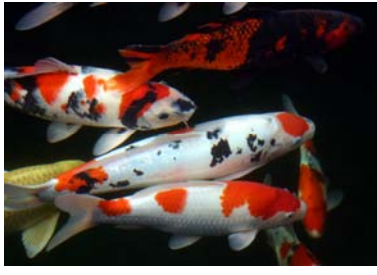
Ah, the joy of keeping koi!

Atlanta Koi Chronicles is a monthly publication of the Atlanta Koi Club. Material is selected for its interest to Koi and Pond enthusiasts. AKC Koi Chronicles accepts no responsibility for the accuracy of the contents. Reproduction is permitted provided that this newsletter and/or the original source are credited. Articles may be submitted to the editor.