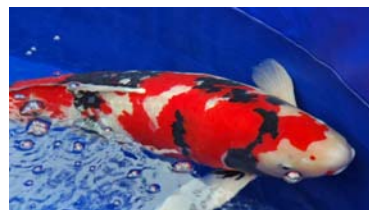
A beautifully healthy koi...at San Diego Show!