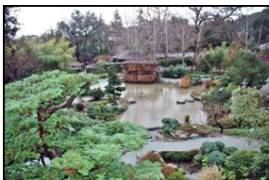
Japanese Garden

Atlanta Koi Chronicles is a monthly publication of the Atlanta Koi Club . Material is selected for its interest to Koi and Pond enthusiasts. AKC Koi Chronicles accepts no responsibility for the accuracy of the contents. Reproduction is permitted provided that this newsletter and/or the original source are credited. Articles may be submitted to the editor.