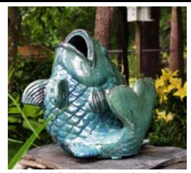
Getting Koi Attention!