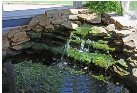
Peggy's "outside in" pond is a restful retreat!