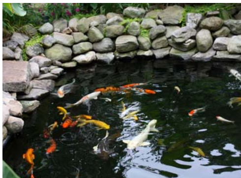
Harvey's fish are bright and cheerful!