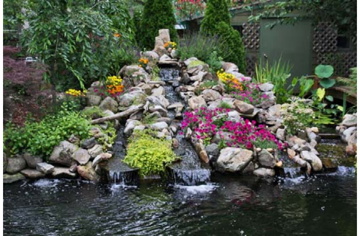
Harvey's waterfall is spectacular!