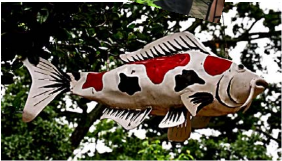
Harvey's huge koi gate keeper is a real standout.