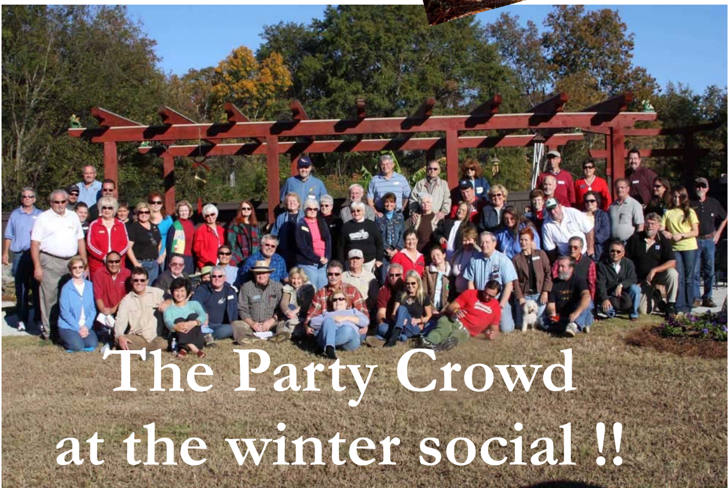
The Party Crowd at the winter social !!