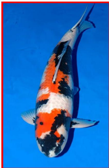
2007 Grand Champion Showa Henry Culpepper Orlando FL

For more information check our club web site: