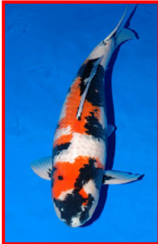
2007 Grand Champion Showa Henry Culpepper Orlando FL

For more information check our club web site: