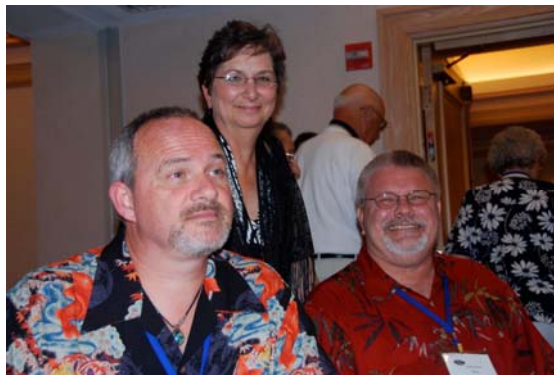
AKCA Is a party.... Right?