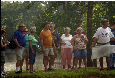
A koi kichi crowd gathered at Flat Rock for a blessing of the first mud pond.

This mud pond is for the big girls like this goromo. She is joined by a sensational kohaku and five other beauties.