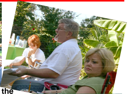
We started the planning for the Koi Show in 2008!