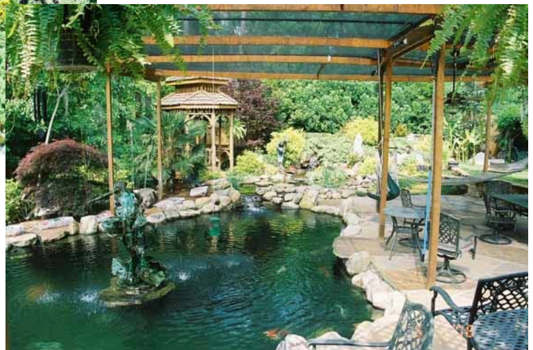
Main Pond with covered patio ...